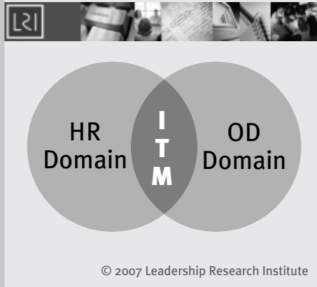
Figure 1: HR and OD “Sweet Spot”

also define human resources systems as mechanisms and procedures for selecting, training, and developing employees; these may include reward systems, goal setting, career planning and development, and stress management. Clearly HR and OD need a wide array of knowledge and skills that cross multiple of the behavioral and social sciences disciplines to increase organizational effectiveness.