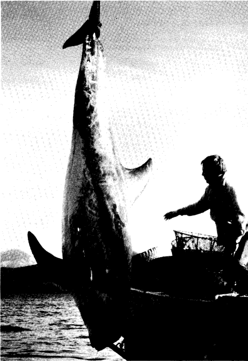
FIGURE 1. Risso's Dolphin from the Queen Charlotte Islands. This animal live-stranded and died.

Africa (Barnard 1954). In the Pacific they are found as far north as the Gulf of Alaska (Braham 1983) and the Kurile Islands (Leatherwood and Reeves 1983), and as far south as central Chile (Aguayo 1975). They are distributed throughout the Indian Ocean (Kruse et al. in press ) and are thought to be present throughout the Indo-Pacific area, occurring as far south as New Zealand and Australia (Mitchell 1975a). No information is