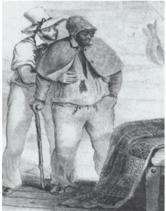
This slave probably is dressed in plantation-made tow trousers and shirt. The clothing of the white man, possibly the overseer, is in better condition, but also could have been plantation-made. He would have received more frequent allotments of better quality clothing. "Live Stock, Virginia 1830," from Frances Trollope, Domestic Manners of the Americans, 1832.