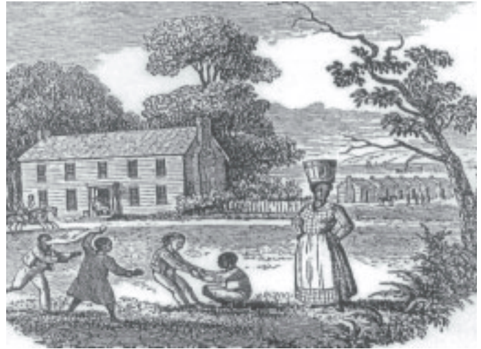
In this ca. 1840 scene, the woman and children probably are dressed in plantation-made clothing. Her dress of check fabric and her apron signify her status as a house servant. Three of the children, both black and white, are dressed in shirts, trousers, and jackets. The fourth child, possibly a boy, is younger and wearing either a slip dress or a long shirt.