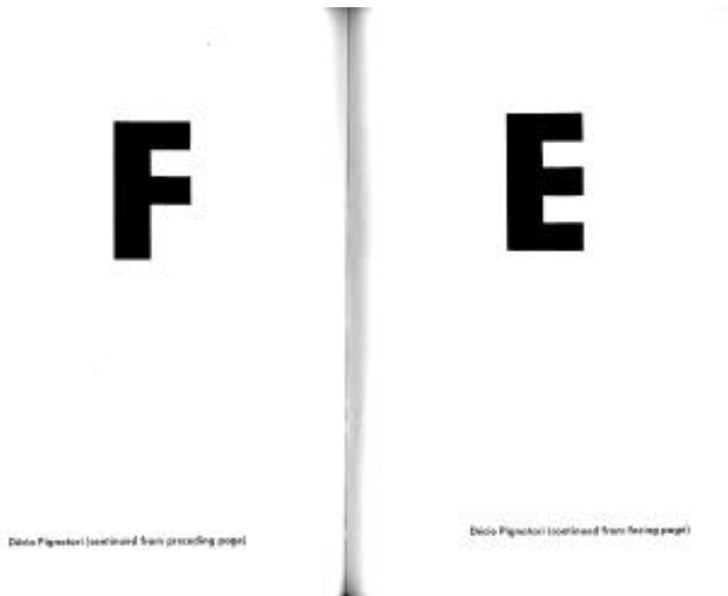
Figure 2. Excerpt from Décio Pignatari's cine-poem "LIFE" as published in Emmett Williams' An Anthology of Concrete Poetry (Something Else Press, 1967).