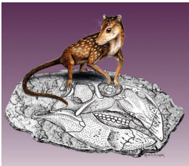
Not just a dental record. The single specimen of Jeholodens jenkinsi is a nearly complete articulated skeleton and skull (from the Early Cretaceous of Liaoning Province, China). This eutriconodont probably weighed less than 30 g and fed mainly on insects and other invertebrates.

Research in the field was rekindled in the 1940s, with discoveries of early Mesozoic mammals in Britain. The pace of exploration accelerated in the 1960s. Unlike in earlier years, when finds of mam-