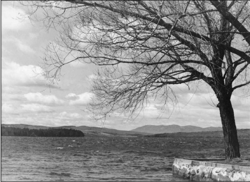
Photograph of Lake Megantic showing the corner of a jetty and probably Mont Megantic in the distance across the lake.

reveals, however, young Scots and French Canadians still battled each other in the town of Lake Megantic which sprang up with the arrival of the International Railway in 1879. 10